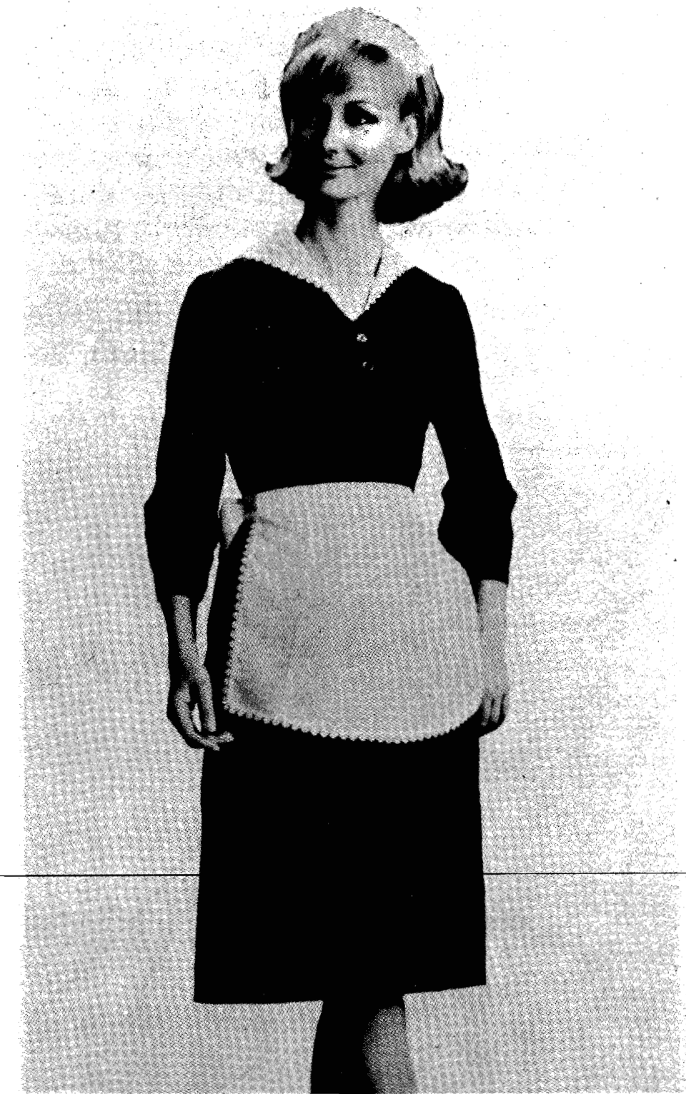
Fig. 2:2 Good posture and a neat appearance are characteristics of an efficient waitress.