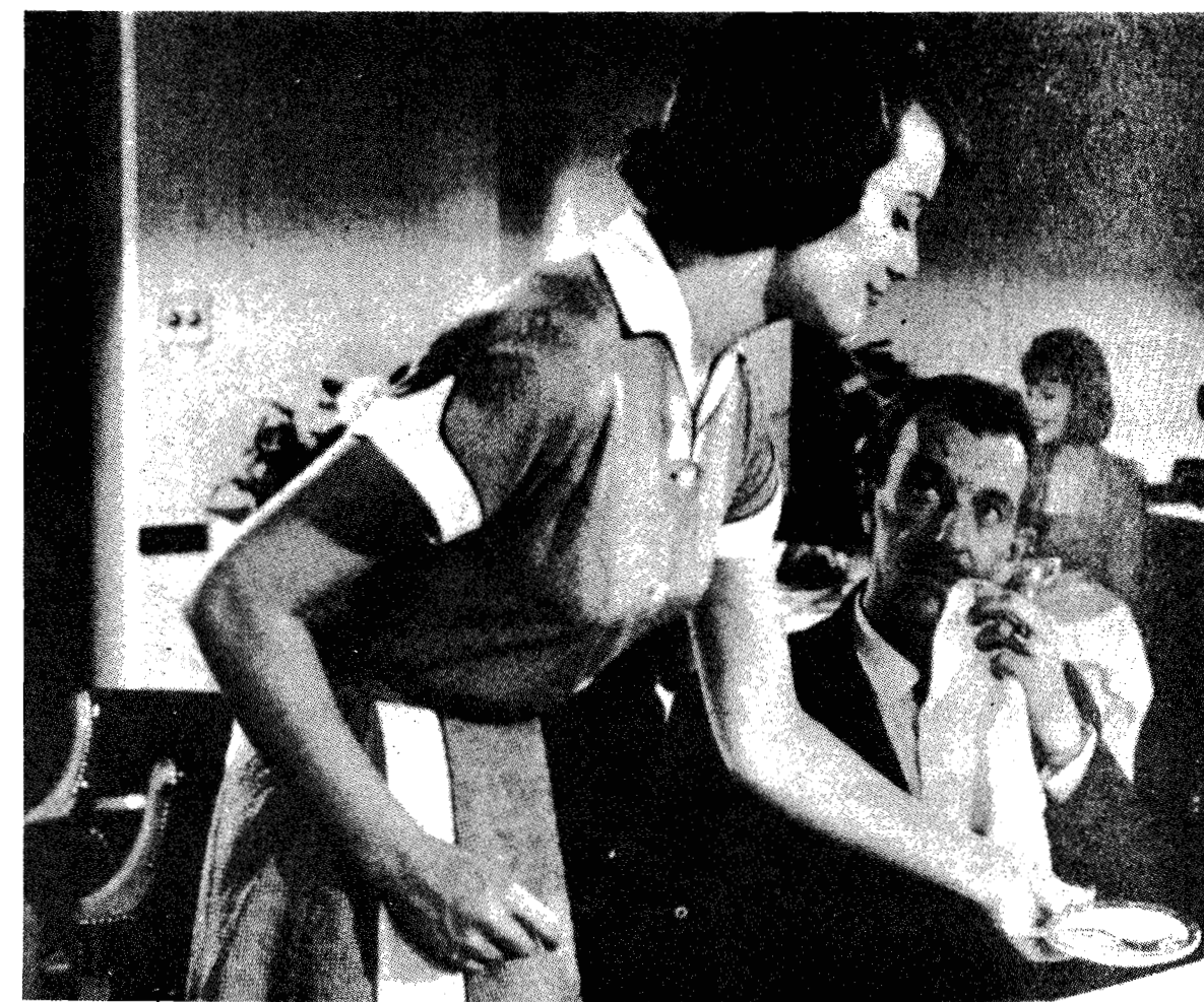
Fig. 5:6 Dishes must be cleared after each course.

The rim represents the waitresses — the salespeople who bind the wheel together.